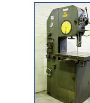
HESKA 16" VERTICAL BAND SAW MOD. BSO, W/ BLADE WELDER & GRINDER