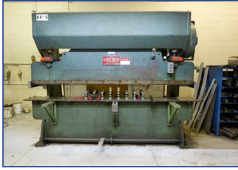
CHICAGO MECH. PRESS BRAKE MOD. 810L, 10 FT X 90 TON, W/ DIE RAIL, S/N: 15791