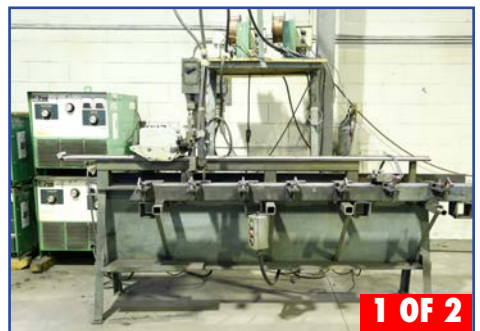
72" TWIN HEAD SEAM WELDER W/ LINDE LTEC VI-252 WELDERS & FEEDER (1 OF 2)