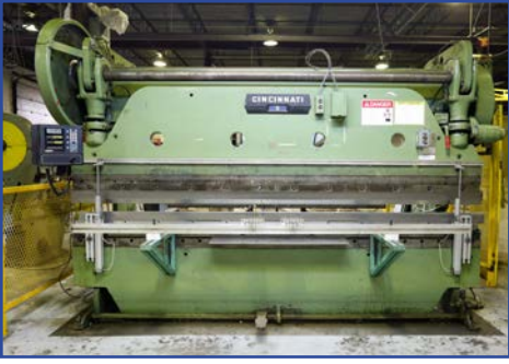
CINCINNATI MECH. PRESS BRAKE SERIES 5, 12 FT X 135 TON, FAGOR 2 AXIS CNC CONTROL, S/N: 33919