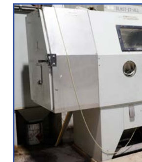
BLAST-IT-ALL SAND BLAST CABINET MOD 48 36-7DC. W/ DUST COLLECTOR