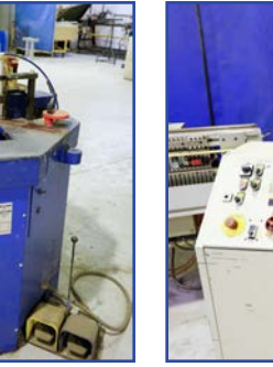
JOMA PROGRAMMABLE ROLL TYPE GASKET PRESS MOD. C41-A90S4