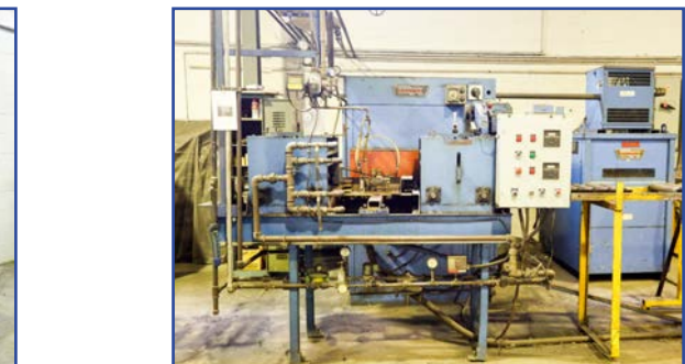
RADYNE INDUCTION TYPE CONTINUOUS FLOW HEAT TREATING LINE MOD. R/503, 100 KVA, S/N: 14224