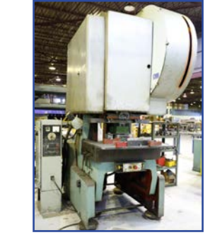
SMERAL 63 TON PUNCH PRESS, AIR CLUTCH, 71-140 SPM, ADJ. STROKE 10-105 MM