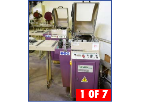
FOM VARIABLE ANGLE END-MILLING MACHINE MOD. MIS-TRAL 26A, AUTO. CLAMPING & FEED (2001)