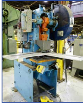
ALCECO 15 TON OBI PUNCH PRESS MOD. K182T