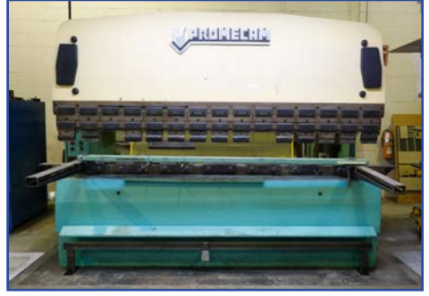
PROMECAM HYDRAULIC PRESS BRAKE MOD. RG-153, 10 FT X 150 TON, S/N: 226