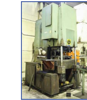
SMERAL 100 TON PUNCH PRESS, VARI. STROKE & SPEED, AIR CLUTCH