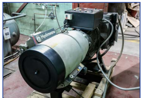
COMPAIR 30 HP AIR COMPRESSOR MOD. 148PUAS