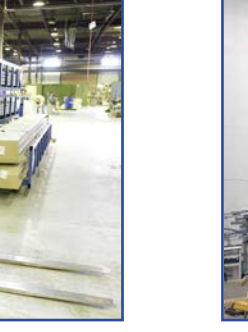
IMPACT TEST MACHINE