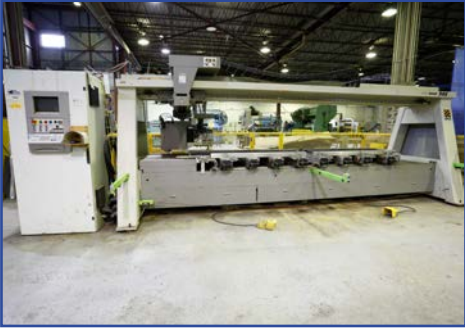
BIESSSE FEED THROUGH TYPE CNC ROUTER MOD. ROVER 346, (2) 6' X 4' TABLES, X & Y BORING (1997)