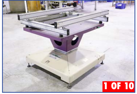
FOM PNEUMATIC TILGINT/ROTARY ASSEMBLY TABLES MOD. FULCRUM, 27" X 43" (2001)