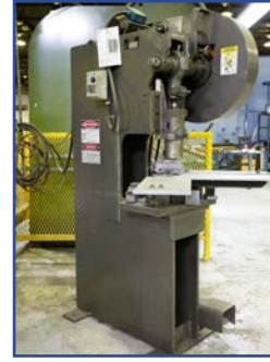
AZIMUTH 10 TON PUNCH PRESS, 1-3/4" STROKE, 144 SPM