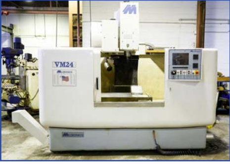
MILLTRONICS CNC V.M.C MOD. VM24, 45" X 24" TABLE, 24 ATC W/ 14 TOOLS, CENTURION 6 CNC CONTROL, 220 VOLTS (2009)

INSPECTION: WEDNESDAY MARCH 14 - 9:00 AM TO 5:00 PM OR BY APPOINTMENT