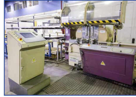
FOM PROGRAMABLE DOUBLE MITER SAW MOD. BLITS 50 THETA-E, 550 MM BLADE, 10 FT CUT-OFF, PLC CTRL, LABEL PRINTER (2001)