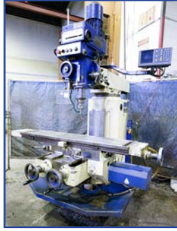
TOS MILLING MACHINE MOD. FNK2, 12" X 51" TABLE, 6 HP HEAD, 40 TAPER, ACCURITE DRO