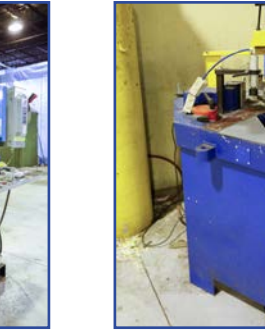
ITACA CORNER CRIMPER MOD. M-2001 (2006)