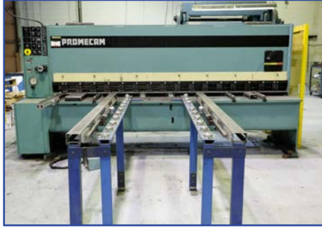
PROMECAM HYDRAULIC SHEAR MOD. GH2630, 10 FT X 1/4", POWERED BACKGAGE, RAKE ADJUSTMENT, S/N: 220