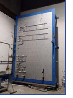
AIR & WATER TEST WALL & CHAMBER