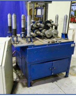
72" TWIN HEAD SEAM WELDER W/ LINDE LTEC VI-252 WELDERS & FEEDER (1 OF 2)