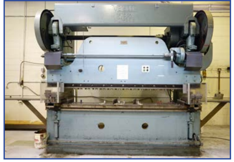
VERSON MECH. PRESS BRAKE MOD. T58A, 10 FT X 100 TON, S/N: 3818