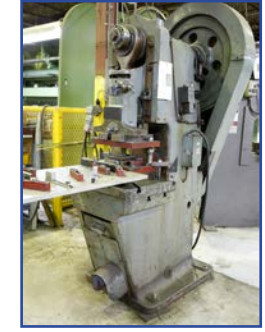
ESTARTA 40 TON PUNCH PRESS MOD. 403, VARI. STROKE