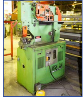
MUBEA IRONWORKER MOD. HPSN 350, 40 TON, 3" X 3" X5/16", W/ PUNCH & DIES