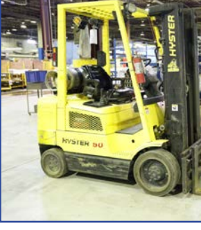
HYSTER PROPANE FORKLIFT MOD. S50XM, 5000 LBS CAP.