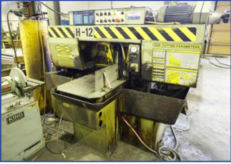
HYD-MECH FULLY AUTO. HORIZONTAL BAND SAW MOD. H-12, 12" CAP, HYD. CLAMPING & FEED, PLC-100 CONTROL (1993)