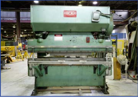
CHICAGO MECH. PRESS BRAKE MOD. 68-B, 8 FT X 55 TON, S/N: 19426