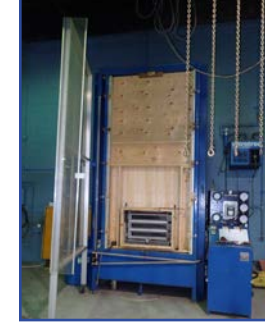
AIR & WATER TEST WALL & CHAMBER

ASSORTED PUNCH PRESSES, DRILL PRESSES, DRILLING & TAPPING MACHINES, FORD-SMITH MODEL S GRINDER, FORD SMITH CUT-OFF, FORTE HORIZ. BAND SAW • 30 KVA SPOT WELDER, WEGOMA ROUTER, PERSKE CNC ROUTER, SAMPSON DOUBLE MITER SAW FOM SINGLE MITTER SAW, CONTINENTAL 8 FT BELT SANDER, EISEL 12" AUTO. CUT-OFF SAW, KINGPI T-SAF-30 TURRET FABRICATOR, INFRAITREA TIP DC-50 HD DRIPP-MENT, HARDNESS MEASURING INSTRUMENT, DROP & DEFLECTION TEST MACHINE, TC PINS FEEDER, AS-SORTED MATERIAL RACKS, WORK TABLES, RACKING, MOBILE TOOL BOXES, CUSHMAN BATTERY MOBILE CART, OFFICE EQUIPMENT, LARGE QUANTITY OF ALUMINUM EXTRUSION, HARDWARE, & MUCH MORE