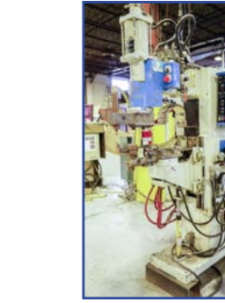
KIMURA PRESS TYPE SPOT WELDER MOD. SW50, 50 KVA, SOLID STATE CONTROL