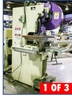
AZIMUTH 10 TON PUNCH PRESS, 1-3/4" STROKE, 144 SPM