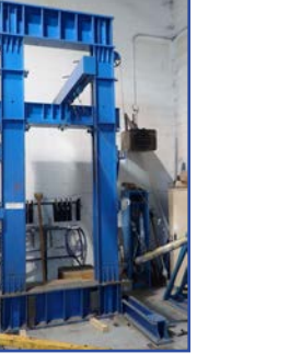
AIR & WATER TEST WALL & CHAMBER