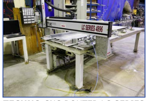
TECHNO CNC ROUTER LC SERIES 4896, 4' X 10' TABLE, 18,000 RPM SPINDLE