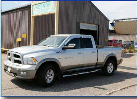
(21) SERVICE VEHICLES AS NEW AS 2012