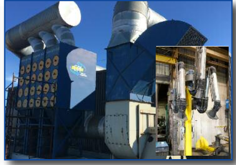
CPI 100 HP DUST COLLECTOR SYSTEM