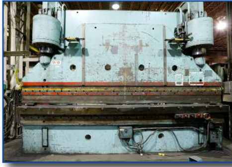
CINCINNATI 400H SERIES 400 TON X 14 FT OVERALL HYD. PRESS BRAKE