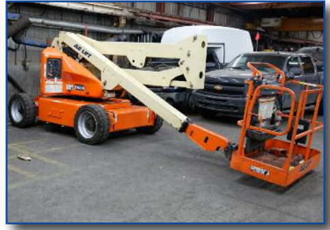
JLG E450A ELECTRIC BOOM LIFT, 45 FT CAP.