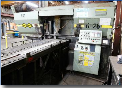
HYD-MECH H-26 AUTO. BAND SAW