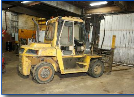
FORKLIFTS UP TO 15,000 LBS CAP.