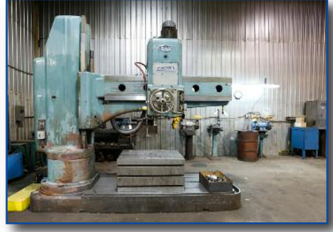
MAS VR6A 6 FT BOX TYPE RADIAL DRILL