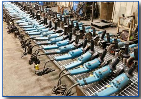
200+ ELECTRIC & PNEUMATIC GRINDERS, POWER TOOLS, ETC..

PARTIAL LISTING - VISIT WWW.CIACPC.COM FOR FULL AUCTION CATALOGUE & SALE DETAILS