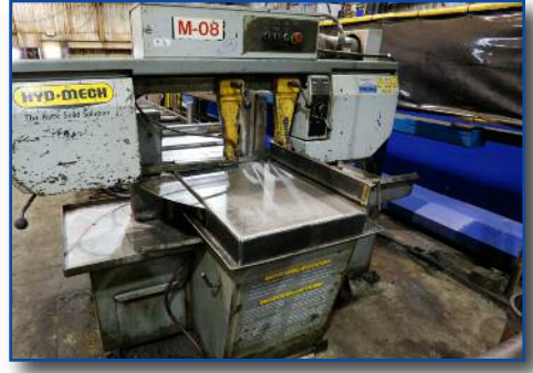
HYD-MECH S20A SERIES II AUTO. BAND SAW, 20" CAP.