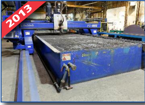
MACHITECH AUTO. PC-1000 PLASMA/DRILLING TABLE, 30 HP HEAD (2013)

COMPLETE FABRICATION, MACHINING AND WELDING & SAND BLAST DEPARTMENTS, 2013 PLASMA/DRILLING TABLE (44) OVERHEAD BRIDGE CRANES AND JIB HOISTS TO 30 TON, SITE ERECTION EQUIPMENT, RIGGING EQUIPMENT, FACTORY EQUIPMENT AND SUPPORT, (21) SERVICE VEHICLES, OFFICE FURNITURE AND EQUIPMENT & MORE