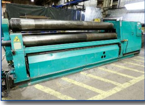
BIKO 3HCD DOUBLE INITIAL PINCH 3-ROLL HYDRAULIC BENDING ROLL