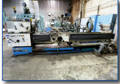
TOS TRENCIN SN 710N HD GAP LATHE, 28" SWING X 126" CENTERS