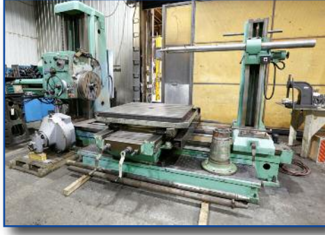
TOS W-100 4" TABLE TYPE HORIZONTAL BORING MILL