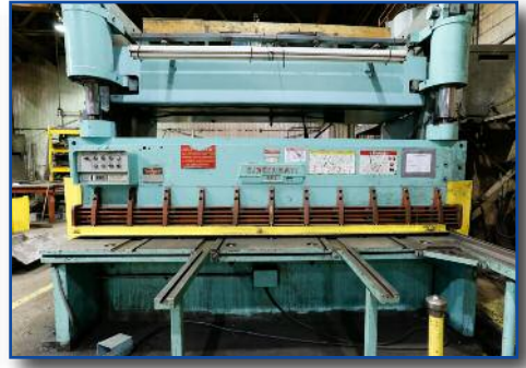
CINCINNATI 5FL10 10 FT X 5/8 HYD. POWER SHEAR