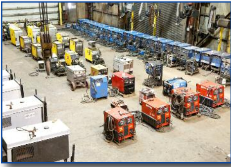
100+ TIG/MIG WELDERS, STUD WELDERS, PLASMA, DIESEL WELDER GENERATORS & MORE