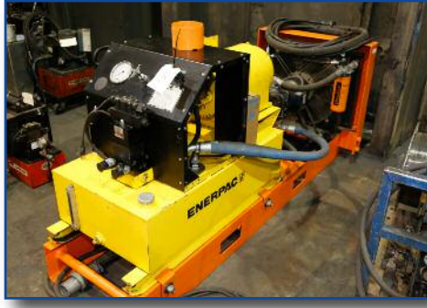
ASSORTED HYDRAULIC POWER PACKS