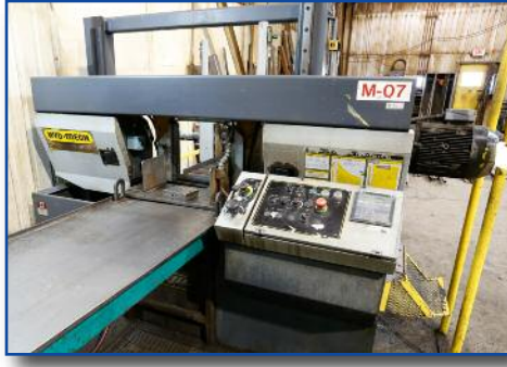
HYD-MECH H14A FULLY AUTO. BAND SAW