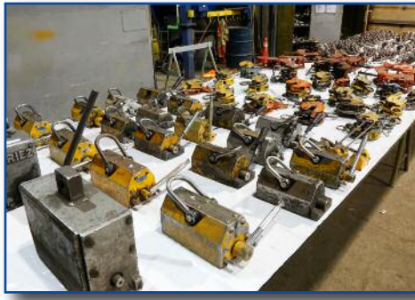
LARGE ASSORTMENT OF MATERIAL HANDLING EQUIPMENT, MAGNETIC PLATE LIFTER, PLATE CLAMPS, ETC..