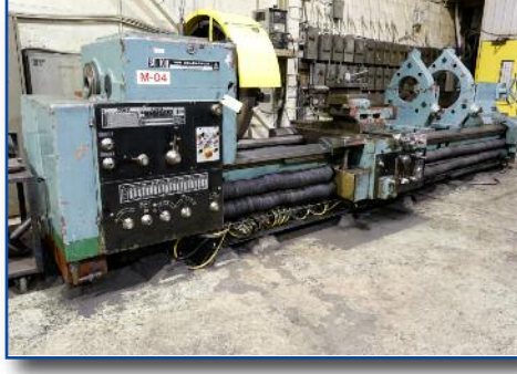
TOS SU100 HD ENGINE LATHE, 42" SWING X 13 FT CENTERS