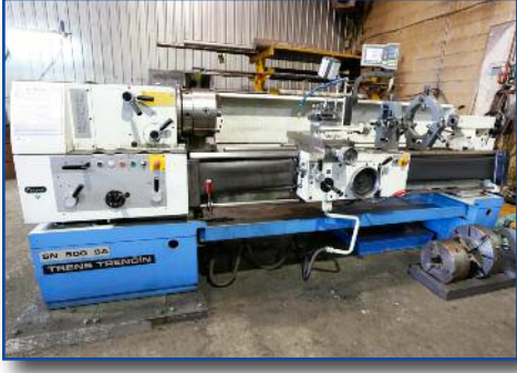
TOS TRENCIN SN500SA HD GAP LATHE, 20" SWING X 7 FT CENTERS